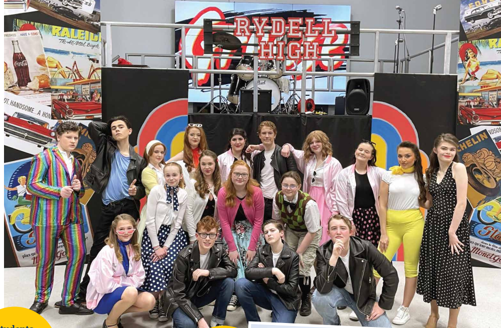
Students perform Grease to sell out audiences

Recent school productions, including Oliver!, and Grease, have been the most inclusive productions that we have held for years, with students showcasing their talents with high quality acting, singing and dancing.