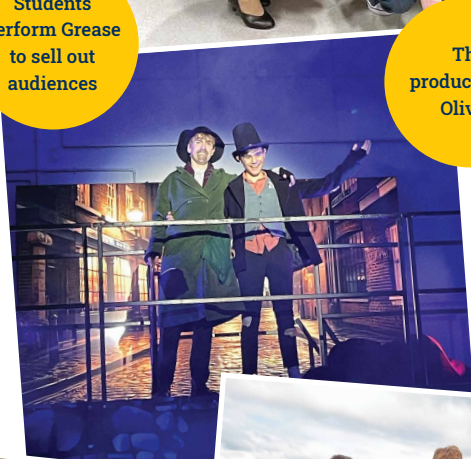
The production of Oliver!

The wide range of trips on offer at Hessle give our students to chance to expand their horizons. We are proud that, through their Houses, our students engage in a range of charity fundraising which benefits the local community.